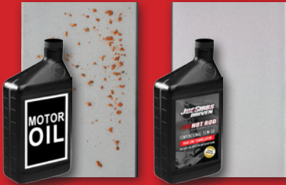
Results of 1,000 hour severe storage simulation

PREVENTS ENGINE RUST AND CORROSION DURING STORAGE!